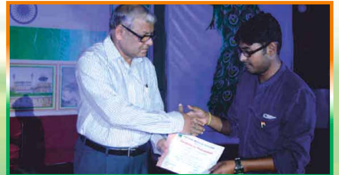
INDEPENDENCE DAY CELEBRATIONS AT COLLEGE