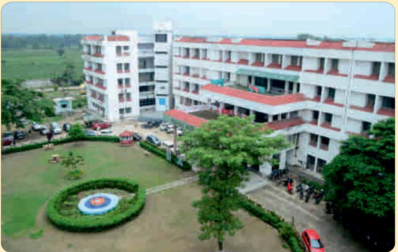
A view of Campus