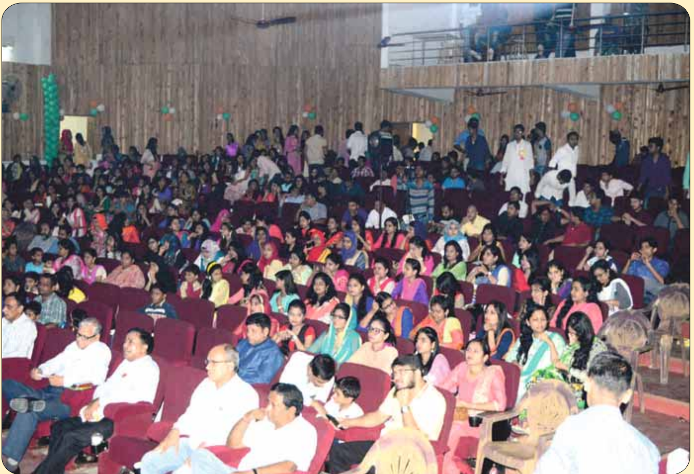
Independence Day Celebrations at College Auditorium