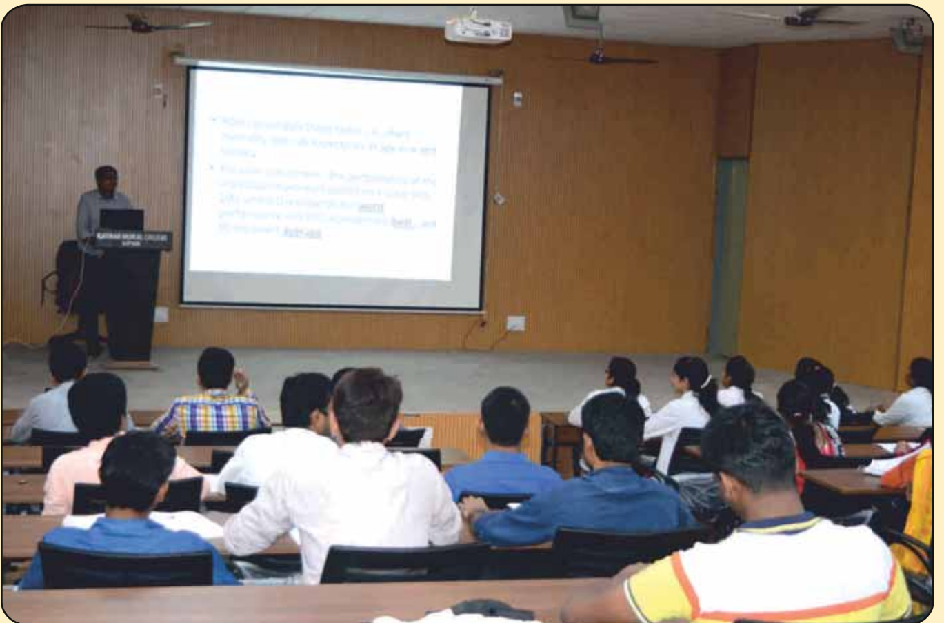
A view of Lecture Theatre