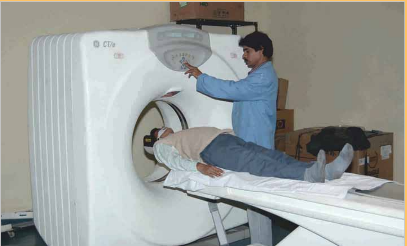
Department of Radiology (CT Scan)