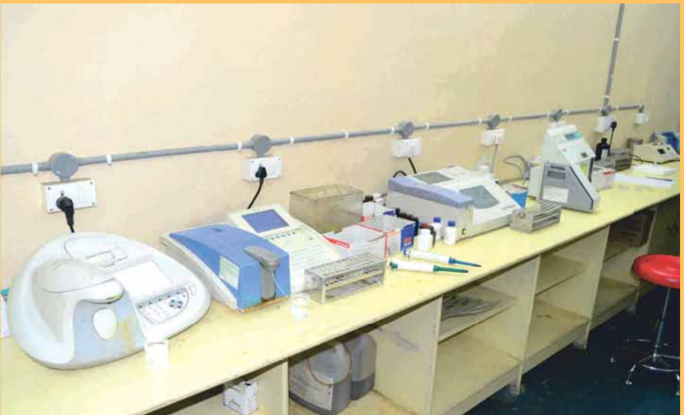
A view of Laboratory